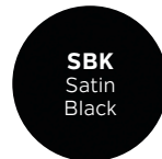
SBK Satin Black