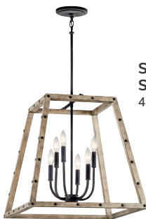
Basford™ Pendant 43520DAG

To see more from these collections visit Kichler.com .