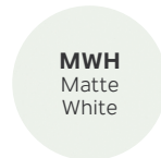
MWH Matte White